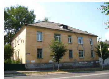
FIG. 3. Eight-flat dwelling