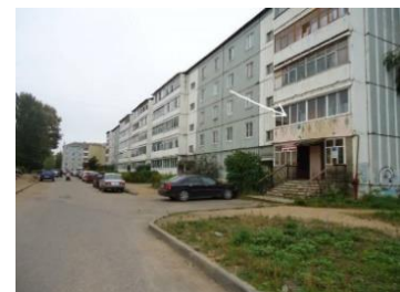
FIG. 4. Multi-apartment dwelling