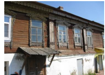
FIG. 2. Individual dwellings. Can be used by one household or shared between two or even three households. Some have retail or other businesses on the ground floor.