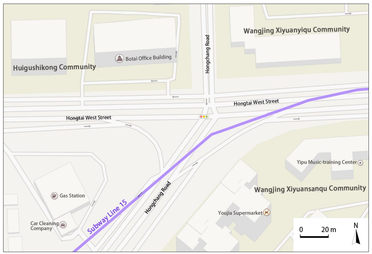
Figure 3: Lay-out map of the Hongchang Road - Hongtai West Street intersection