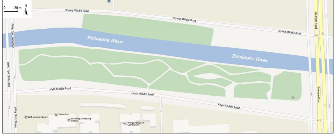
Figure 2: Layout map of a Section of the Beixiaohe River

3. Write brief observations of the water quality of the river in Table 1 below. [3m]