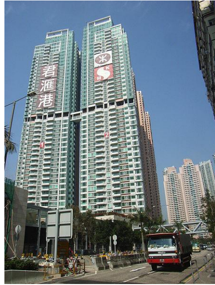
(f) Modern building 2 of the 2000s. 20-storey upwards but subject to local land use plan.