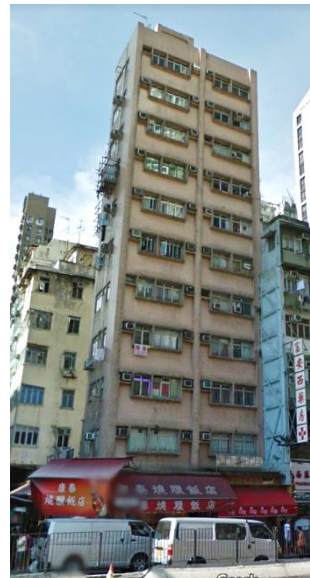
(d) Building of the 1970s having an utilitarian architecture 1 . Usually less than 20-storey.