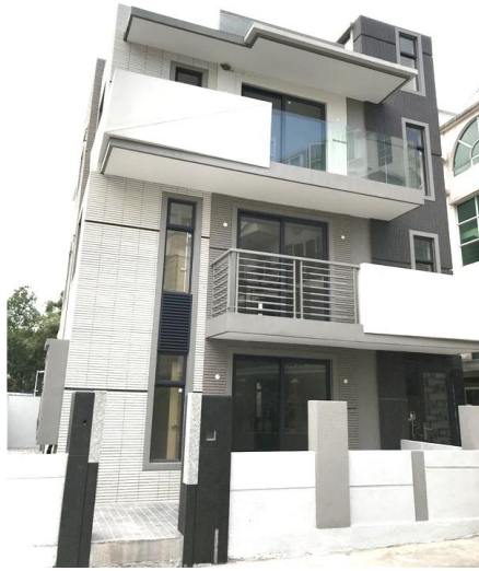
(e) Village house built in 2010s. Having a modern architecture. Floor area 700 feet 2 , 3-storey.