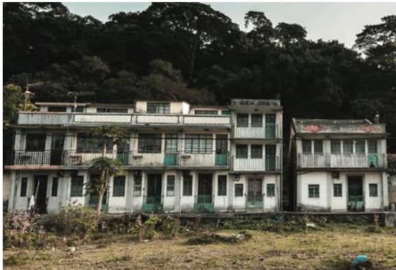
(a) Traditional village house units of the post-war period