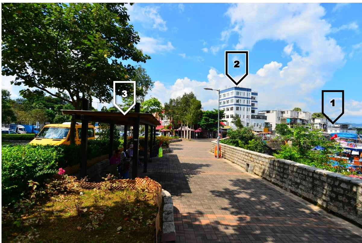
Figure A4: Fieldwork Station ST1. 1: Typhoon shelter; 2: Kat Cheung Building; 3: ST1.