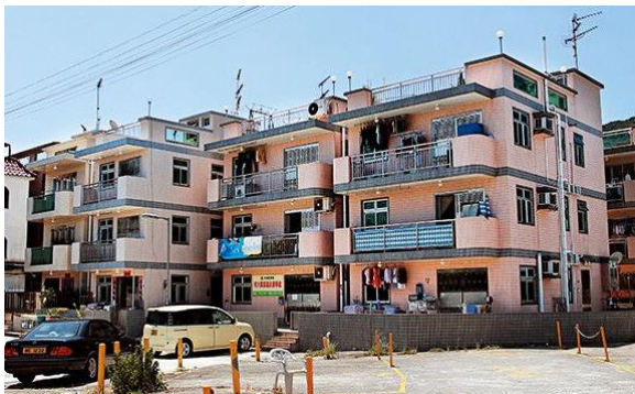
(c) Typical village house unit built after 1972. Floor area 700 feet 2 , 3-storey.