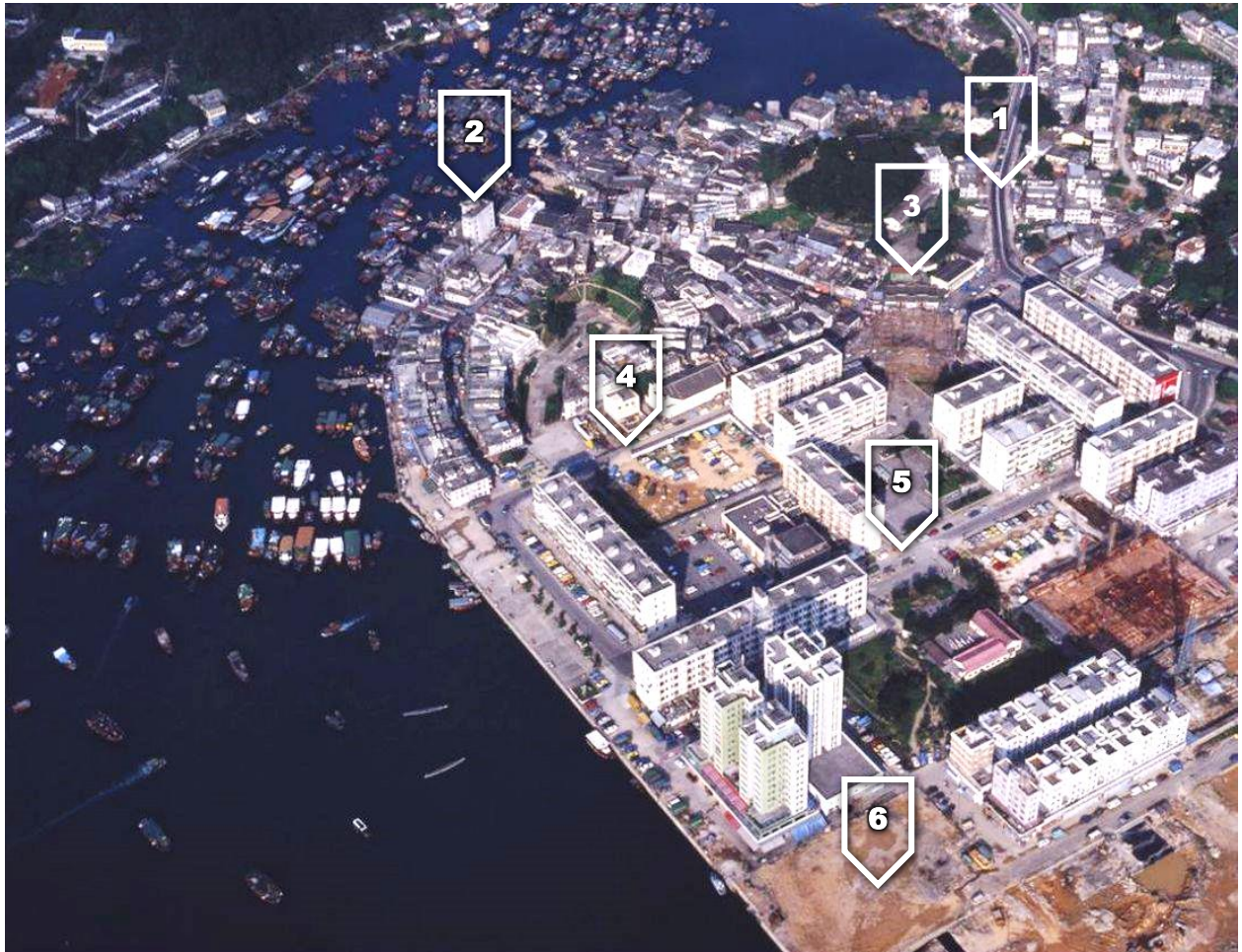
Figure A2: Sai Kung Town, 1983. 1: Hiram's Highway; 2: Kat Cheung Building; 3: Tin Hau Temple; 4: Yi Chun Street; 5: Man Nin Street; 6: Light bus terminal nowadays. New residential buildings on the right foreground were built in 1975 to cater for resettlement due to the construction of High Island Reservoir.