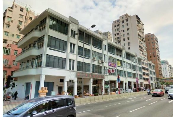
(b) Refurbished pre-war Chinese-style flat.