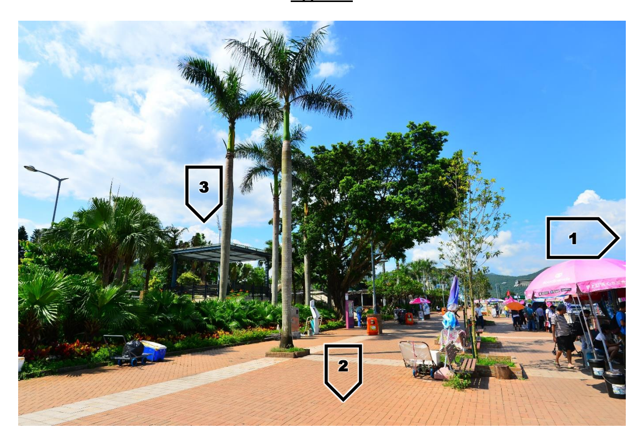
Figure B4: Fieldwork Station ST3. 1: Sai Kung Public Pier; 2: Promenade; 3: ST3 under the cyan metal pavilion with glass ceiling. Walk up stairs to get to it.